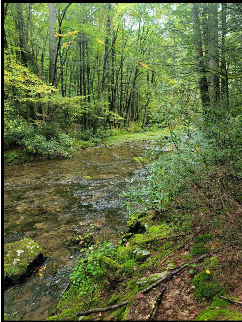
Early color at Bakers Run, southeast of Renovo.

The Clinton County service forester said Sproul State Forest is just beginning to show color along the hillsides and up on the plateau. Despite some spongy moth damage in the district, fall color is more impressive than expected, currently. The best drive is along Route 120 and the Bucktail Natural Area where the sugar maples and tulip poplars are yellowing. Peak color is expected in the region around Columbus Day.