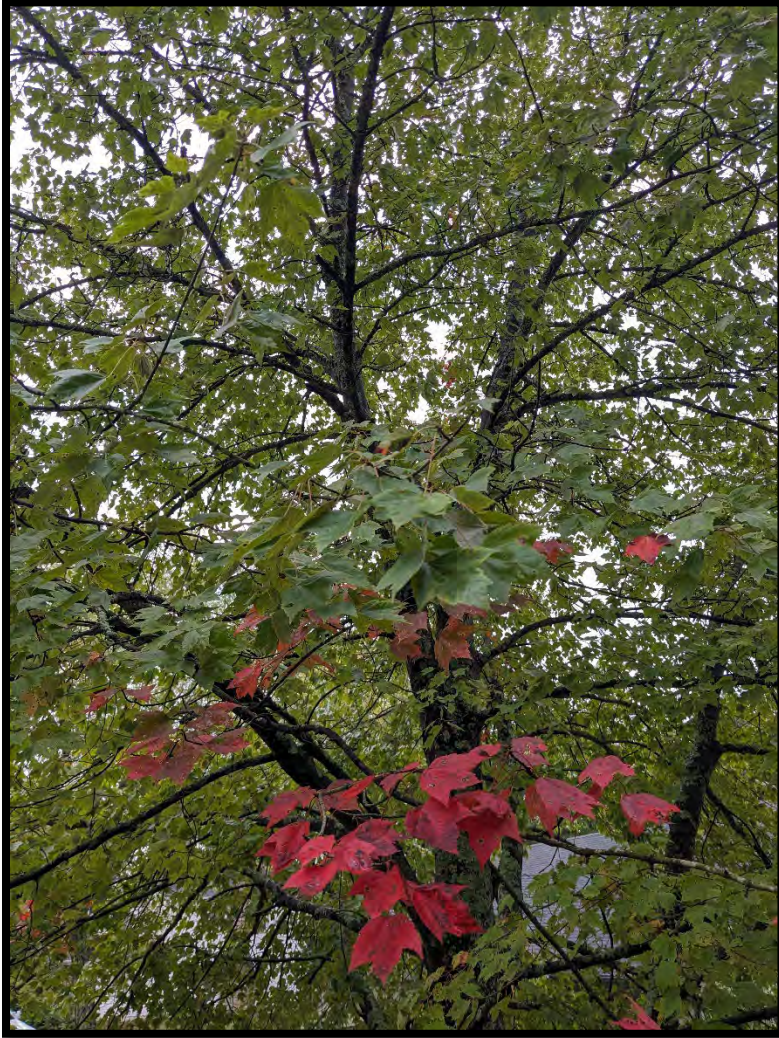
Early red maple color at the Michaux State Forest district office.

The Perry County service forester (Tuscarora State Forest District) said most of the trees are still green in the region, but black walnut leaves are starting to yellow, indicating changes to come. Peak color is expected at the end of October.