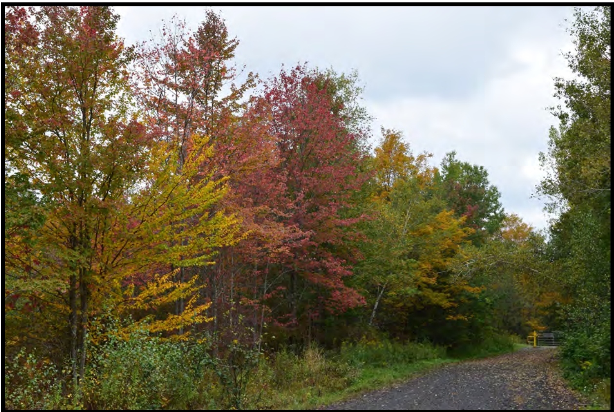
View at D&H Rail Trail near Ararat.