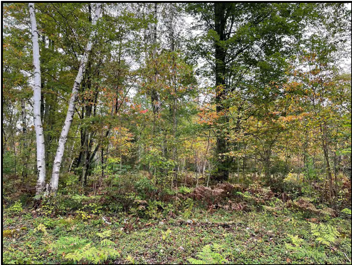
The white birches at Marion Brooks Natural Area are a sight to behold.