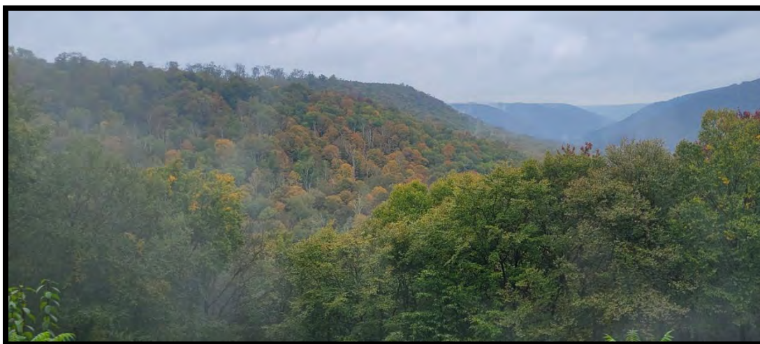
View from Millcreek Road looking down Pleasant Stream, Loyalsock State Forest.

The Sullivan County service forester (Loyalsock State Forest District) indicated that the transition to fall color has just begun, overall. However, some sugar and red maples have changed significantly at higher elevations and closer to water. Sycamore and some birches are changing slowly, as well. Most color change is noticeable along roadways, from vistas, or near water. Route 154, Sones Pond, or the scenic view from High Knob Overlook are recommended destinations, currently.