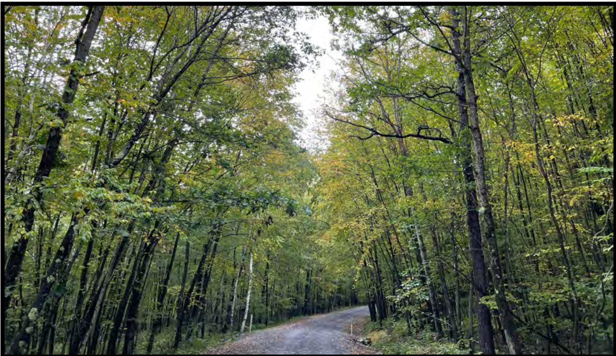
Looking north up Pine Creek from the Sinking Springs Road Vista.