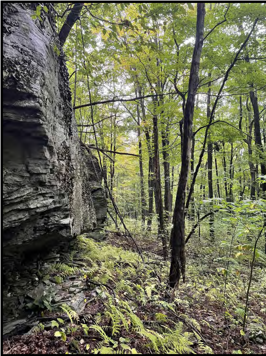
View near High Knob Fire Tower.

Foresters in Pinchot State Forest District (serving Luzerne, Lackawanna, Wyoming, Susquehanna, and Wayne counties) said the northern half of the district has started to show some notable change where northern hardwoods are prevalent. Red maples, staghorn sumac, and Virginia creeper are providing a vibrant red, and sugar maples are adding muted shades of orange and yellow to the landscape. Even poison ivy is adding some beautiful shades of orange. In the southern portion of the district, the primary change has been mostly around wet areas where bright red can be seen in the red maples and high bush blueberry. The northern portion of the district is expected to peak during the second week of October. A good spot to hike for fall color is along the D&H Rail-Trail in Susquehanna County. The southern portion is projected to peak mid- to late October. A recommended drive to view fall foliage in the area is Pittston Road in the Thornhurst Tract.