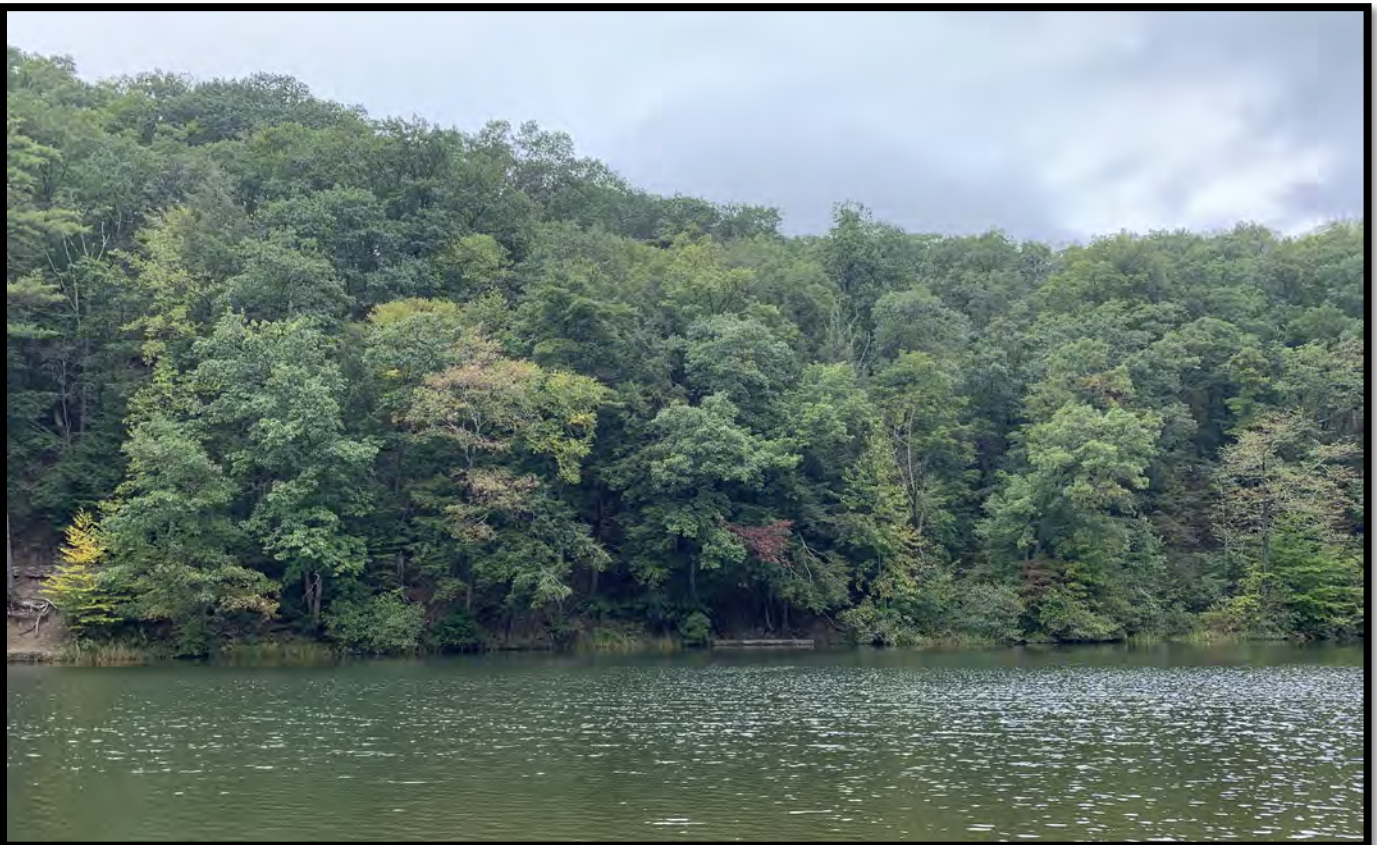
View along lake at Greenwood Furnace State Park.