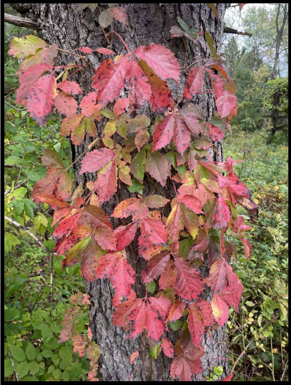
Virginia creeper vine, Warren County.

The district manager in Cornplanter State Forest (representing Warren, Crawford, and Erie counties) said last week's warm, sunny days and cooler nights initiated noticeable color changes in northwestern Pennsylvania. In a preview of what is to come, hillsides and forests are dotted and blushed with color. Some sumacs are beginning to display their brilliant red color, while scattered maples are showing a mix of red, orange, and yellow. Virginia creeper vine is also sporting its fall color, especially against dark backgrounds.