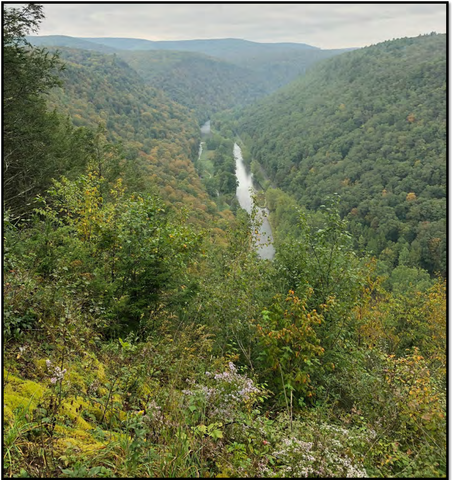
The Pine Creek Valley is still mostly green.

The Clearfield County (Moshannon State Forest District) service forester said area forests are just beginning to change. Red maple, sugar maple, black gum, sassafras, sweet birch, and ferns are starting to show nice color. The stunning white birches at Marion Brooks Natural Area are displaying impressive color now. The best drive to see initial fall color is Quehanna Highway between Medix Run and Karthaus. Oaks are still dark green, so peak color is still two to three weeks away.