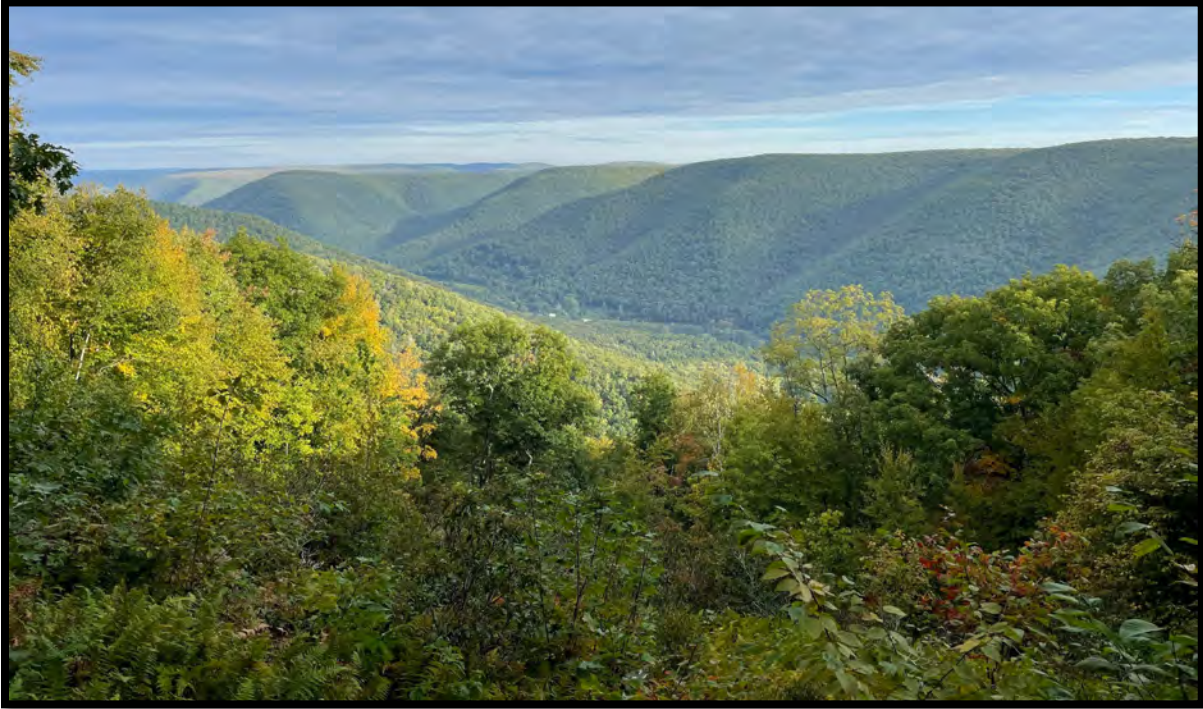
Early fall color along Brown's Run Road, Tiadaghton State Forest.

Staff in Tiadaghton State Forest said area mountainsides and valleys are beginning to shimmer with blotches of fall color. Sugar maple, sassafras, and birch are showing yellows, while red maple, dogwoods, and black gums are blushing red. Best color is expected in about two weeks, but a pleasant drive on Route 414 is recommended to view current color.