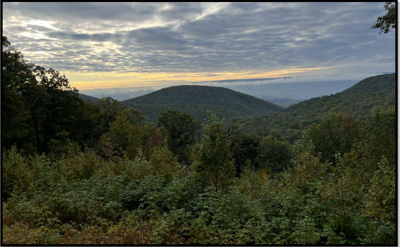
Vista on Buffalo Flat Road, Union County.