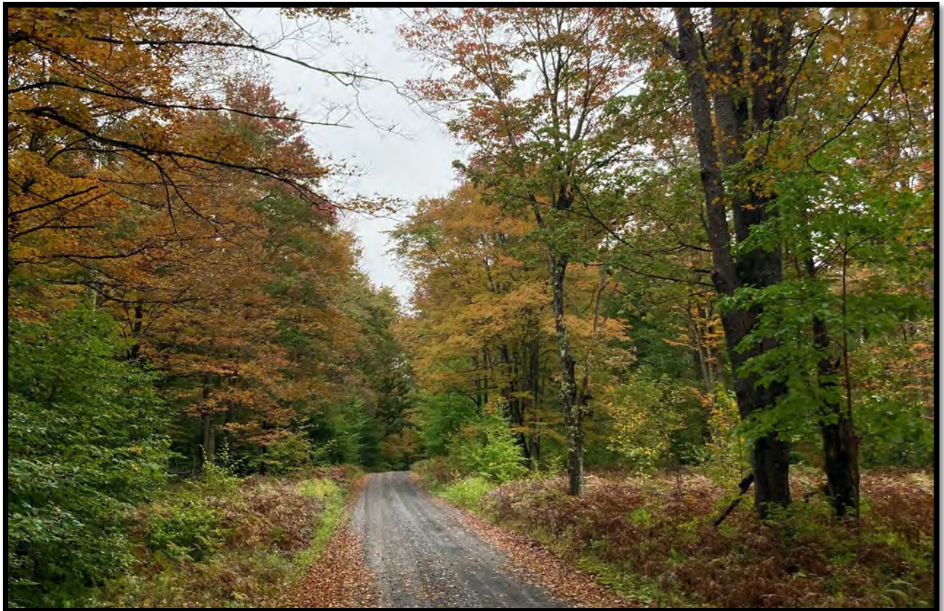
Early fall color along Ridge Road south of the Hunts Run/Bailey Run intersection, Elk State Forest.

Foresters in Elk State Forest said northeastern Elk and southeastern McKean counties are approaching best color. Cameron County, which favors more of an oak forest type, is just beginning to change. Some pockets of red and sugar maple throughout Cameron County are approaching best color. Species currently showing best color in the region include red maple, sugar maple, black gum, and sassafras. Recommended drives are in the East Branch/Clermont area, including Rich Valley, Straight Creek, Naval Hollow, Stillhouse, and Crooked Run roads.