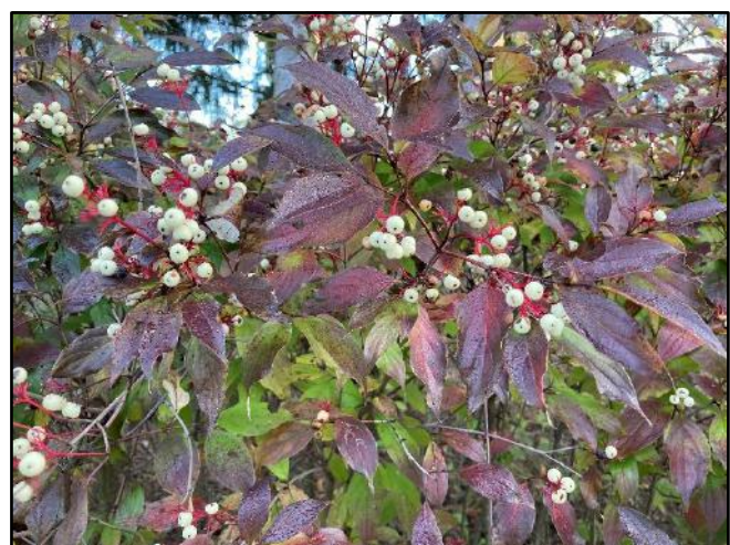
(L) Black gum. (R) Gray dogwood. Clarion County.