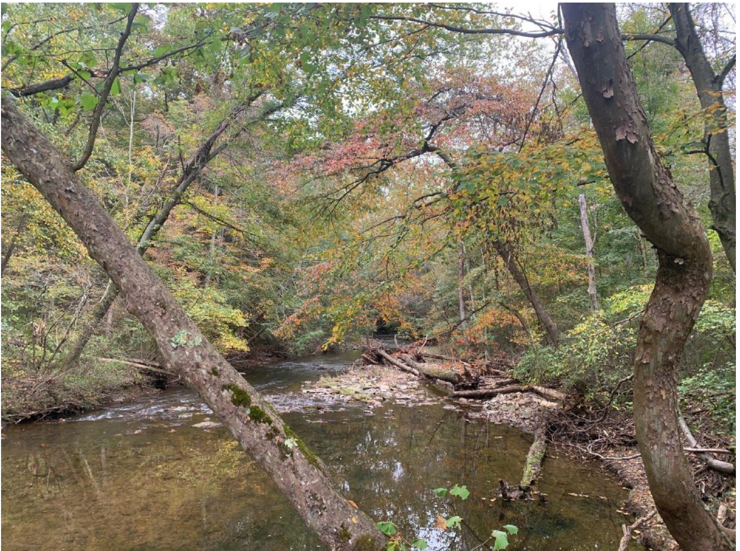
Fall color along Juniata Creek, Perry County.

The Perry County service forester (Tuscarora State Forest) reported that early color can be seen on birch, tulip poplar, black gum, sumac, and maples. For the best views and picturesque scenery in Tuscarora State Forest, sightseers are advised to visit the many vistas throughout the district.