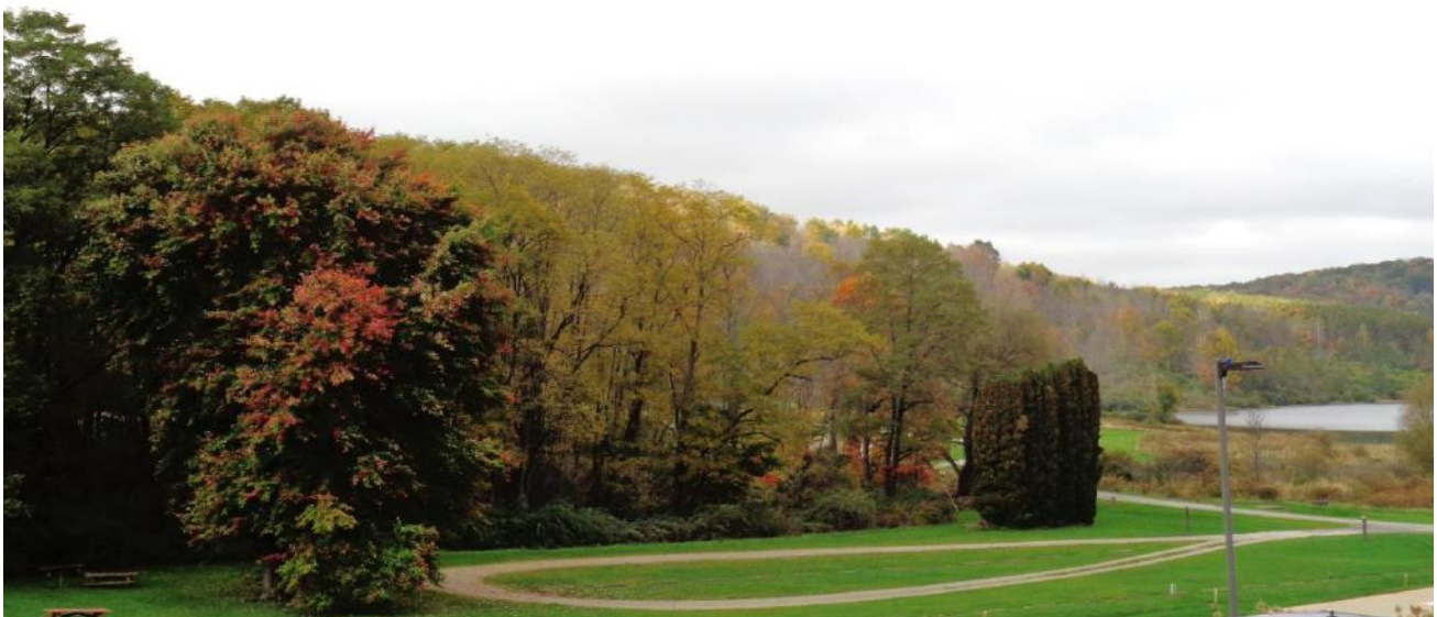
Lake Nessmuk (PA Fish and Boat Commission).

The Tioga County Service Forester reported that foliage in Tioga State Forest is still highly variable. About half of the forest is showing nice color. With temperatures forecasted to drop over the weekend, the region is expected to peak next week. The Armenia Mountain area is currently at peak conditions. To the west, a drive on Colton Road is very picturesque. In Pine Creek Gorge, the colors seem somewhat muted, with the exception of some pockets of red maple standing out in the landscape.