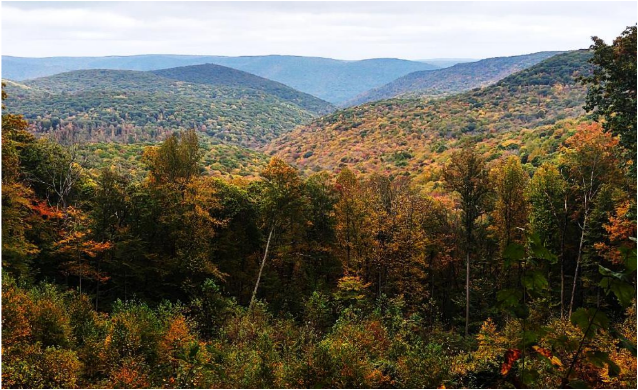
Norcross Vista, Ridge Road, Elk State Forest.

Foresters in Elk State Forest (Elk, Cameron counties) said many of the bright red maples lost leaves during rain over the weekend, but birches are about to peak along with other northern hardwood species. Oaks are starting to show color but could be a week or two away from their peak.