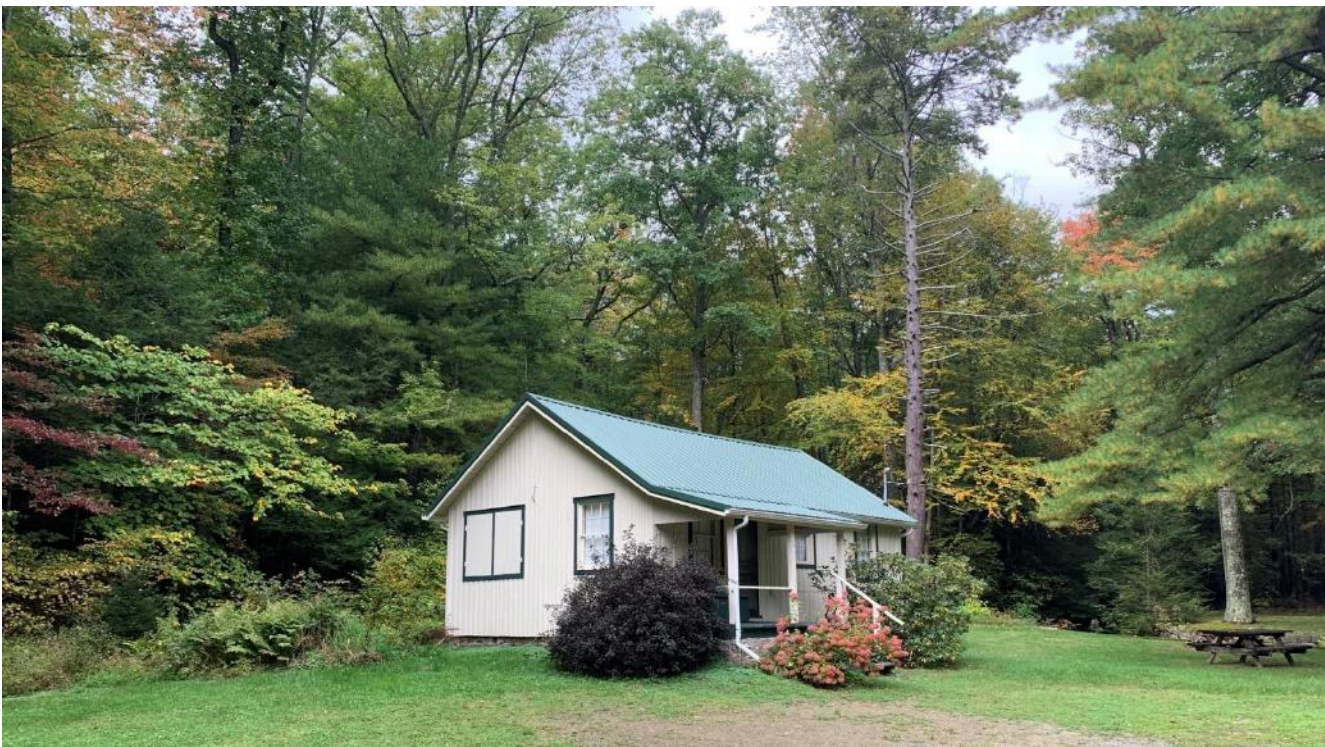
Pleasant color surrounds a cabin in Bald Eagle State Forest.