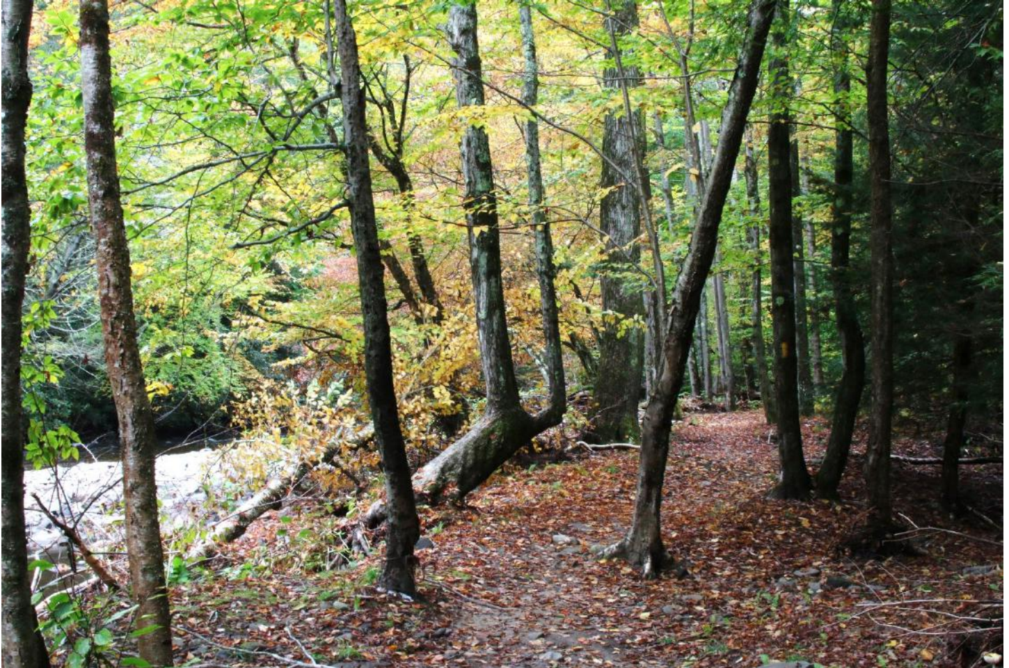
Warm fall colors along the Pocono Trail.

The Pike and Monroe County service forester serving Delaware State Forest reported that oak species are beginning to change into their russet colors. Red maple is at peak red and orange, and sugar maple is currently yellow. Black gum is turning a reddish-burgundy color, while sassafras is showing bright orange. Peak color is most likely going to be at the end of next week. The more northerly areas of the region are showing the most color currently, along with areas of higher elevation. The Route 402 and 209 corridors are optimal options for a scenic drive. Both areas have extensive tracts of publicly accessible land which provide opportunities to hike and get a closer look at the fall colors.