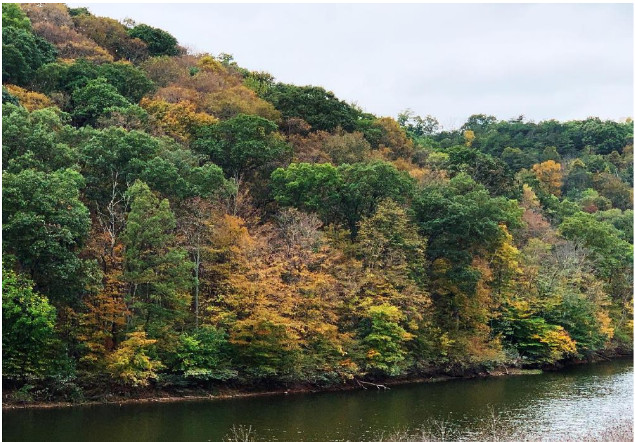
Fall color at Raystown Lake.