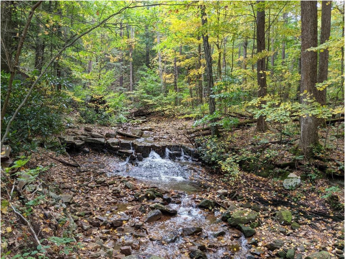
Fish Run, Laurel Mountain Division, Forbes State Forest.

The Mercer/Lawrence County service forester reported that leaf transition has recently slowed, but pleasant color is showing on maples, elms, walnuts, birches, poplars, and aspens. Occasional oaks have added some color, and bright purple asters still adorn the roads with their beauty. This area is displaying what will likely be the best color of the season.