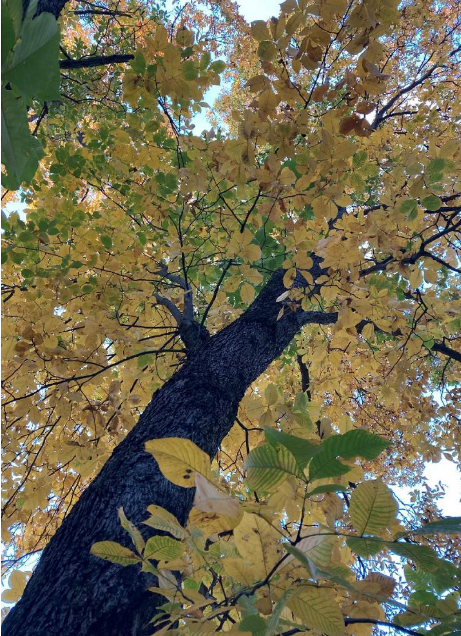
Bright hickory, Cornplanter State Forest District.

The district manager in Cornplanter State Forest District (Warren, Erie counties) reported that most maples are in full color, as are dogwoods, black gum, ash, and hickories. Many oaks are still green, but the predicted cooler night temperatures should compel their fall transition. Yellow and dark crimson are the two most prominently displayed colors; but orange, gold, and russet hues are also appearing on the landscape.