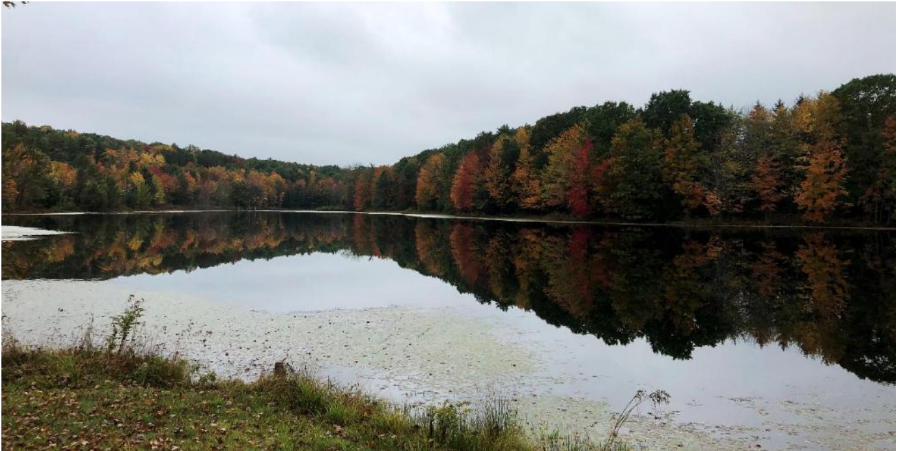
Beautiful colors along irrigation lake at Mira Lloyd Dock Center near Potters Mills.

In Bald Eagle State Forest, Centre County, foresters noted moderate change in color from last week with a few more species displaying change. Sassafras, witch hazel, Black gum, and dogwood are showing orange, yellow, and red. The area is still about a week to ten days from peak.