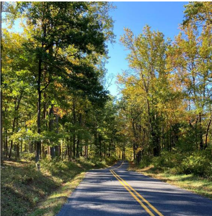
Mount Hope Road, Michaux State Forest.

The Cumberland/Franklin County service forester serving Michaux State Forest indicated that peak color is seven to ten days away in the region. Black gums are beginning to fade, but in many areas, poplar, hickories, red maple, witch hazel, sassafras, dogwoods, and birch are approaching full color. Oaks are also transitioning, with northern portions of the district showing more color than the south.