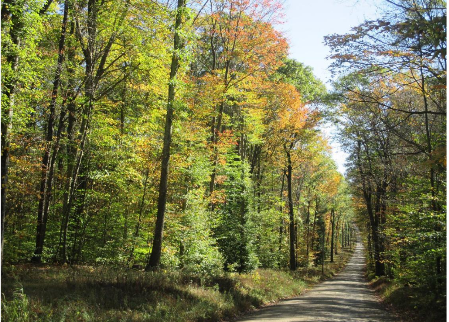
Gorgeous colors on Caledonia Pike, Moshannon State Forest.

Foresters in Moshannon State Forest stated that foliage is still at peak but will begin fading by the end of the forecast period. Maples are holding good color but starting to lose leaves. Sassafras is bright yellow and orange, and black gum is displaying vivid red. Beeches are showing a nice yellow green, contrasting nicely with the still green oaks. A recommended drive is the entire length of Caledonia Pike from the village of Caledonia on Route 555 to Route 879 at Frenchville. Notable stops are the Shaggers Inn Shallow Water Impoundment at the intersection with Shaggers Inn Road and the Gifford Run Vista on Lost Run Road.