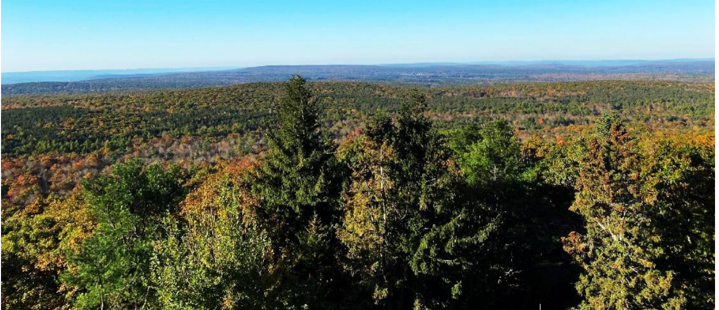
Fall hues from the Pohopoco Fire Tower, Delaware State Forest.

The Pike and Monroe County service forester (Delaware State Forest) said the best fall colors can be seen in the Monroe County portion of the district. Good fall color can also be found in areas that received less rain and wind over the last few days. Fall color in Pike County is diminishing. The best fall colors can be viewed from Big Pocono State Park and along Blue Mountain.