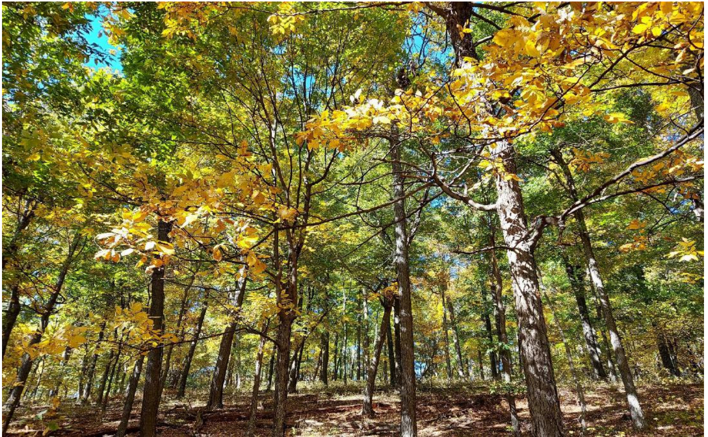
Bright colors on Martin Hill, Chaneyville Division, Buchanan State Forest.