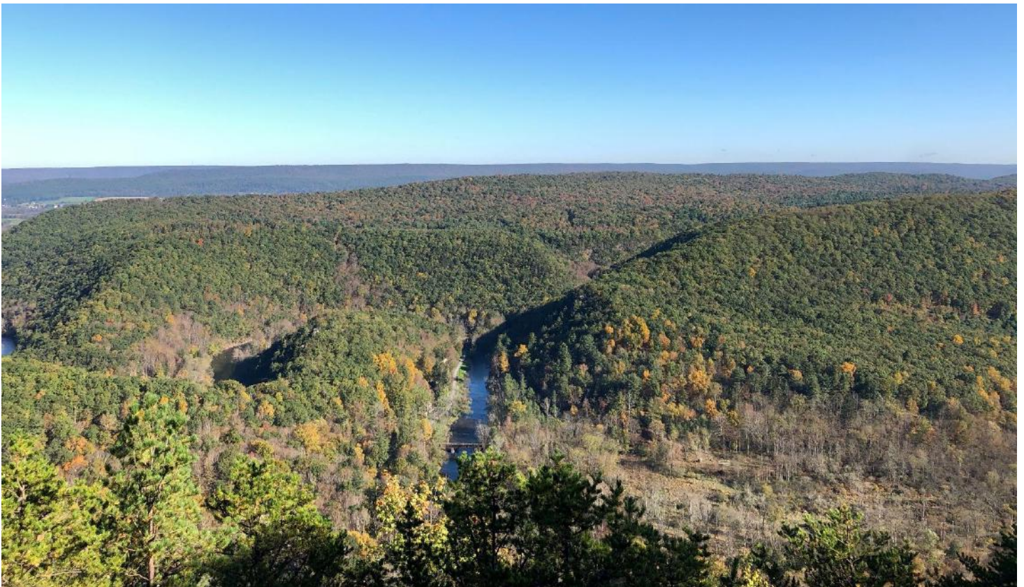
Beautiful colors from Penns View Vista.

The Union, Mifflin, and Snyder County service forester (Bald Eagle State Forest District) indicated peak conditions in the region. Birches have dropped most of their leaves, but most tulip poplars are yellow. Sugar maples and hickories are showing bright yellow to orange. Most black gums are reddish, and red maples are turning. Many oaks have begun the transition, although most remain mostly green. Beautiful foliage drives in the area include routes 45, 192, 104, and 235. For a fantastic fall hike full of color, take the White Mountain Ridge Trail (near Weikert) for a tour through the Penns Creek Wild Area.