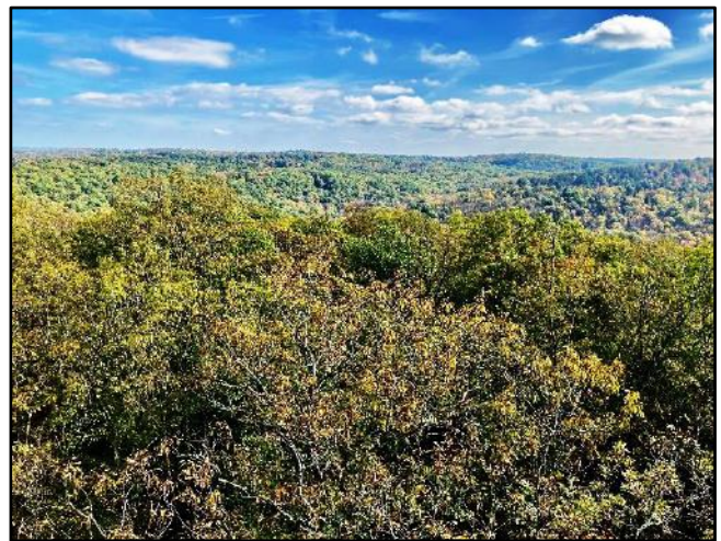
(L) Buffalo Creek, Armstrong County. (R) Seneca Fire Tower, Cook Forest State Park.

The Cambria County service forester (Gallitzin State Forest District) reported past peak conditions in higher elevations of the Babcock Division to the southeast of Johnstown. In the lower elevations near Altoona, leaf change has been slow, but recent cold has driven a rapid transition in birch, poplar, beech, and hickory. The widespread red oaks of the Rager Mountain Division northwest of Johnstown should provide some nice color toward the end of the month.