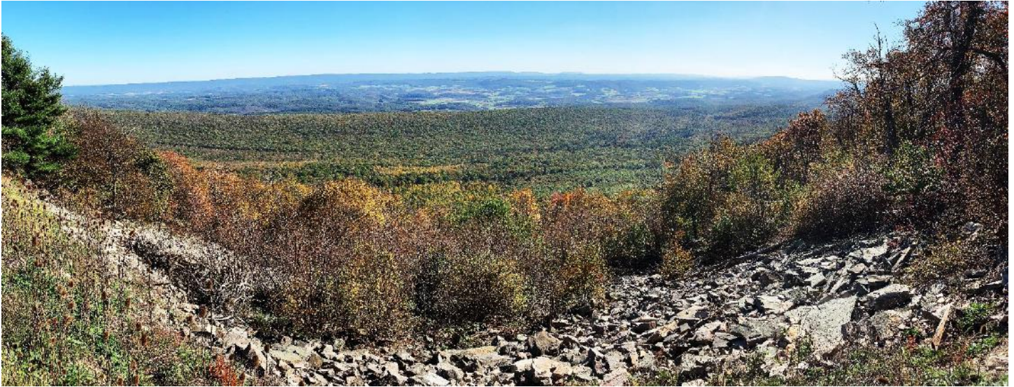
The view from a vista on Pennsylvania Furnace Road.

Foresters in Rothrock State Forest said the best leaf color is beginning now and will likely continue through next week. Oaks have finally begun to change in many areas, which will bring out pleasant color on hillsides across central PA. Many other species are still retaining brilliant foliage too. This weekend should be the best chance to catch a glimpse of this yearly spectacle since the long-term weather forecast is calling for cloudy, wet weather for the latter part of the month. Ridgetop vistas make great places to observe the maximum amount of color, but beauty will be found everywhere in the forest this week.