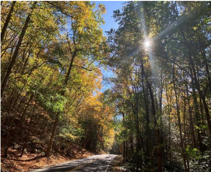
Fall color along Route 850, Perry County.

The Perry County service forester (Tuscarora State Forest) reported that oaks are still green but bright colors can be seen in birch, hickory, and maples. Views along stream valleys show nice color contrast with hemlocks. The ridges and valleys around Tuscarora State Forest are currently showing good color, but the next two weeks will get even better for fall foliage in the district.